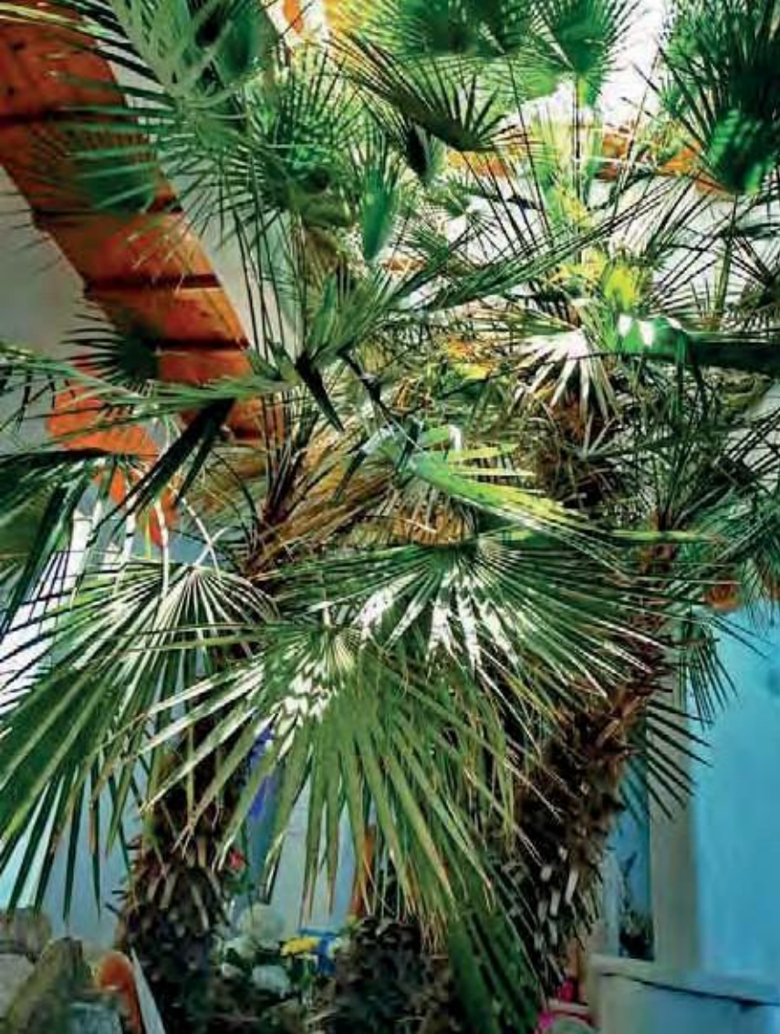
NATURAL PALM TREES